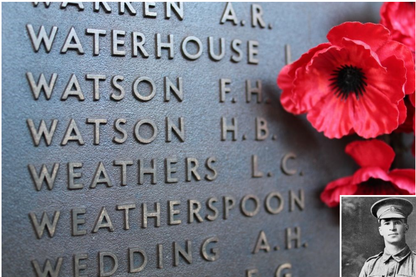
Lawrence Carthage Weathers VC 1890-1918

Above: His name on the Roll of Honour, Australian War Memorial, Canberra